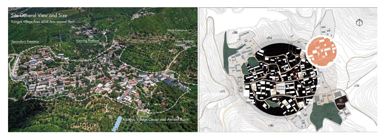
Fig.1 (a) Site General View and Size; (B) a Map Shows the Geographic General Situation of the Research Area.