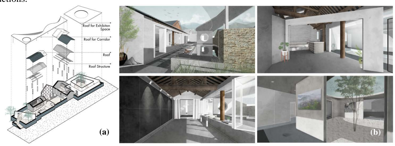
Fig.4 (a) Explosion map of residential buildings; (b) Renderings of courtyard landscape, multimedia space, cafe, and backyard.

space. At the same time, the attributes of this space are defined by endowing this space with functions.